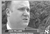
Fighting the income tax increase plan KGW-8 5/13/09