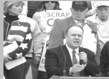
TAO Director speaking before Tax Day Rally at State Capitol

One of the reasons Democrat Legislative leaders are calling for tax increases is to cover Kulongoski's negotiated $250 million in raises for government employees to take effect this summer.