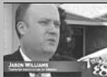
Criticizing the 21% state budget growth KGW 8 2/2009