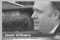
Defending the Tax Day Rallies for giving taxpayers a voice KOIN-6 4/14/09