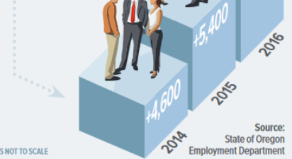
GRAPHIS NOT TO SCALE

OREGON ADDS 17 NEW GOVERNMENT JOBS EVERY SINGLE DAY